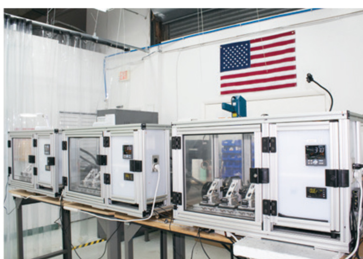
Implant lifecycle fatigue testers

With a multidisciplinary team of experts, TAG3 takes ideas from concept all the way through a limited market launch and focuses on everything in between.