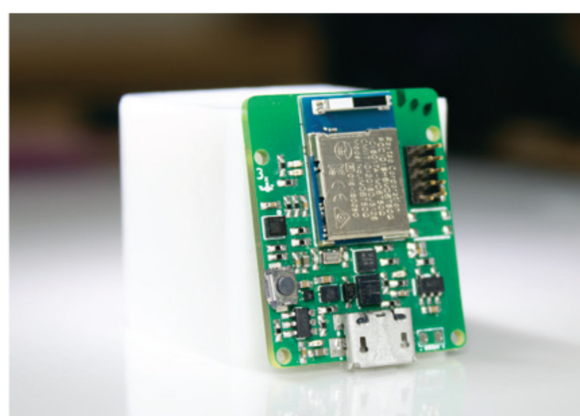
Multi-sensor circuit board designed in-house